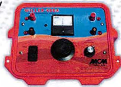
Miller 400A Analog Resistance Meter Cat. No. 44500