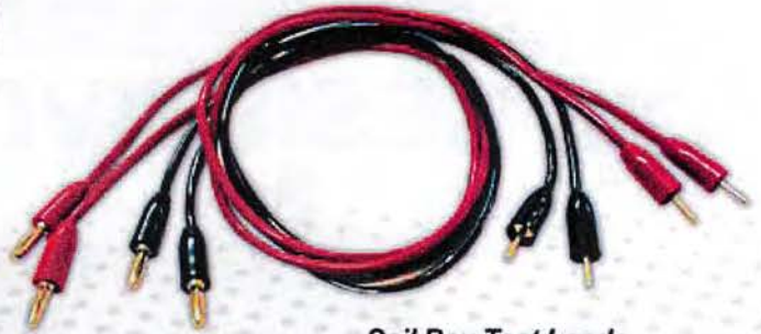
Soil Box Test Leads Cat. No. 37009