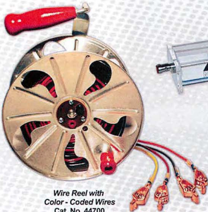
Wire Reel with Color - Coded Wires Cat. No. 44700