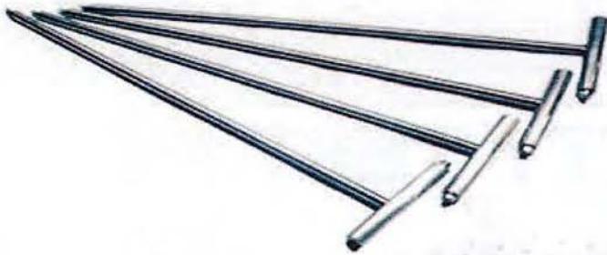
4 - 3/8" dia x 18" long Stainless Steel Replacements sold individually Cat. No. 44720