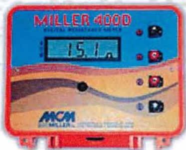
Miller 400D Digital Resistance Meter Cat. No. 44550

Optional Resistance Meters Sold Separately