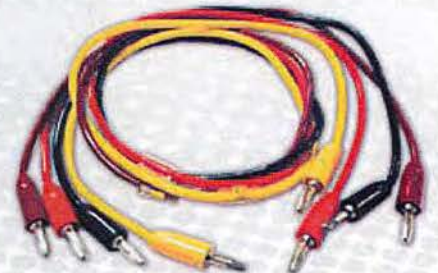
4 Color - Coded Reel - To - Meter Leads Cat. No. 44695

Optional Resistance Meters Sold Separately