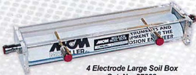
4 Electrode Large Soil Box Cat. No. 37008