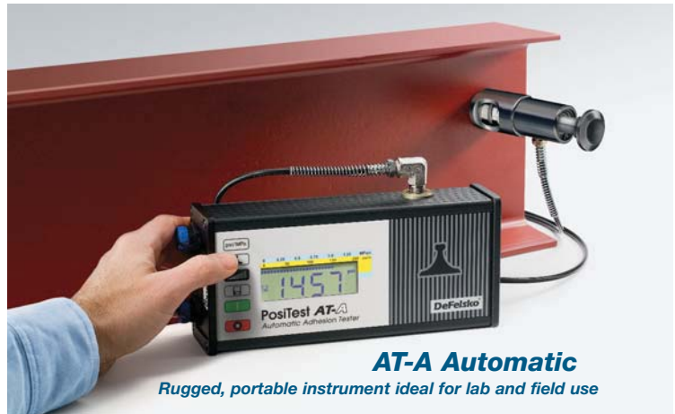
AT-A Automatic Rugged, portable instrument ideal for lab and field use