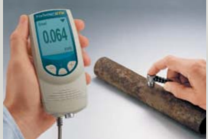
UTG Std measures the remaining wall thickness of steel, cast iron and more due to the effects of corrosion and erosion.