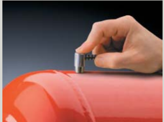
UTG ME Thru-Paint model measures the metal thickness of a painted structure without having to remove the coating.