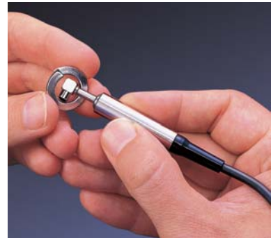
Microprobe series for small parts and hard-to-reach areas