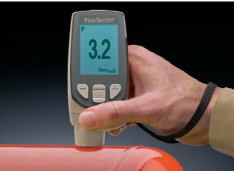
For measuring paint, powder, etc. on all metals...