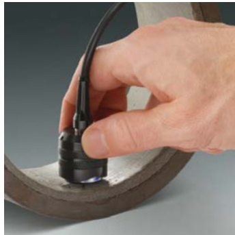
High-Range Probes for thick coatings, e.g. fire proofing, tank linings, etc.