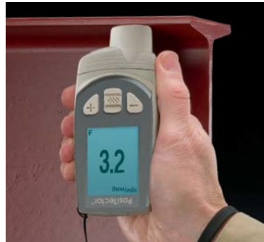
Flip Display enables right-side-up viewing