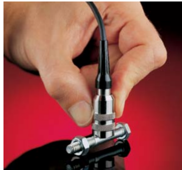
...and for measuring galvanizing, plating, anodizing and more.