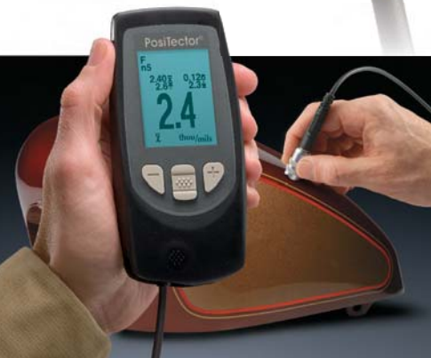
Standard model shown in Statistics Mode with shock-absorbing, protective rubber holster