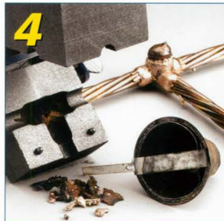
4 Open the mold and remove the expended steel cup – no special disposal required

CADWELD PLUS Control Unit initiates the reaction of the metal crucible. The standard unit includes a 6-foot (1.8 meter) high temperature control unit lead. The lead attaches to the ignition strip using a custom made, purpose-designed termination clip.