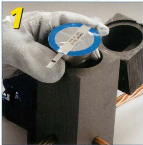
1 Insert CADWELD PLUS package into mold (may require use of a cover/baffle)