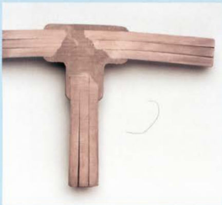
The CADWELD molecular bond will last the lifetime of the conductors.