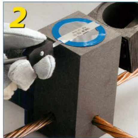
2 Attach control unit termination clip to ignition strip