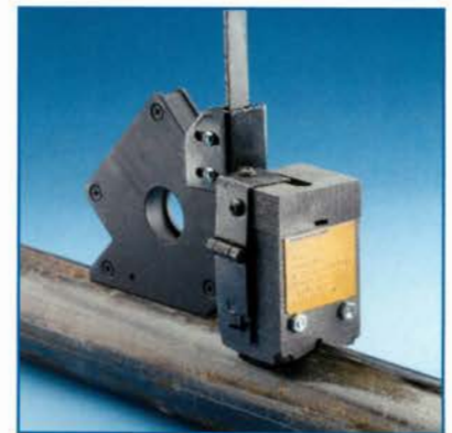
"A" Price Key Mold on Steel Pipe