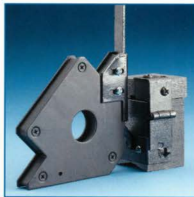
Hold Down Magnet Assembled on Mold

The magnetic hold down assembly holds "A" Price Key molds securely to large flat or slightly curved horizontal steel surfaces during the connection process.